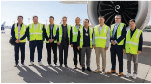
PAL executives were warmly welcomed by the Boeing team at their Everett facility. They had a first-hand look on some of the new aircraft types on offer from the manufacturer.