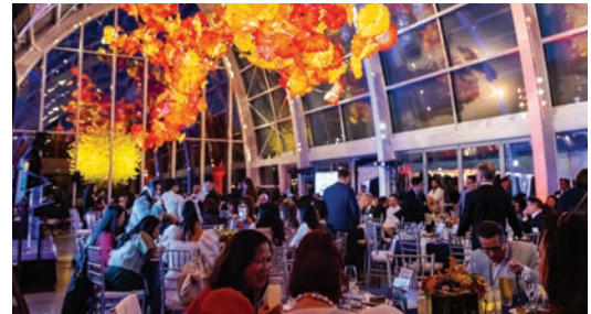
Guests were serenaded by iconic Filipino band Side-A, underneath the gleaming 100-foot glass sculpture made by American artist Dave Chihuly.