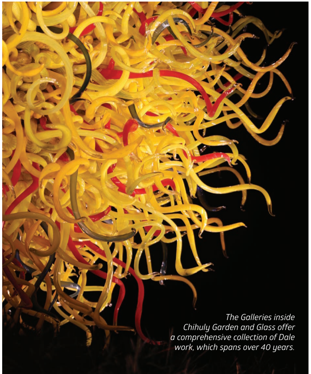
The Galleries inside Chihuly Garden and Glass offer a comprehensive collection of Dale work, which spans over 40 years.

of wire sculptures and iconic mobiles. “Calder: In Motion, The Shirley Family Collection” was the first comprehensive public display of 48 seminal works from the artist.