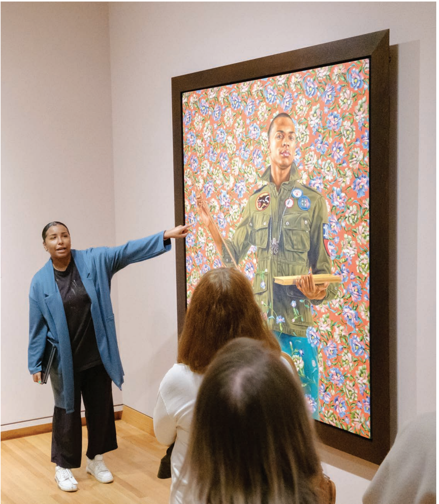
The Seattle Art Museum houses hundreds of artworks, including traditional and mixed media. It also holds various exhibits where you can meet local artists throughout the year.