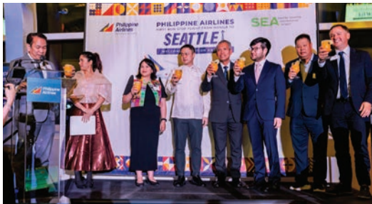
The guests raised their glasses to celebrate the first non-stop service to the US Pacific Northwest.